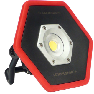
LUMENATOR® Jr MXN05200